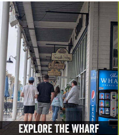
EXPLORE THE WHARF