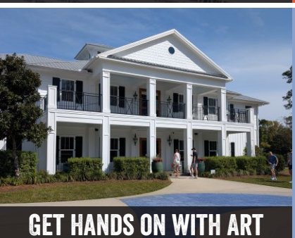
GET HANDS ON WITH ART