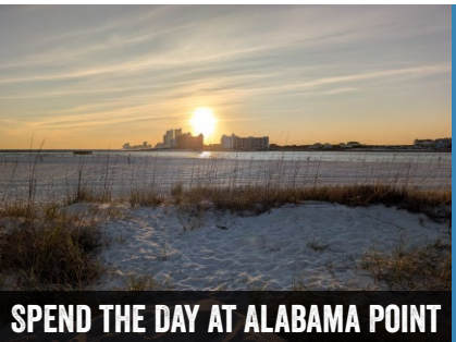
SPEND THE DAY AT ALABAMA POINT