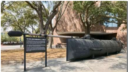
VISIT THE H.L. HUNLEY AND FRIENDS OF THE HUNLEY MUSEUM