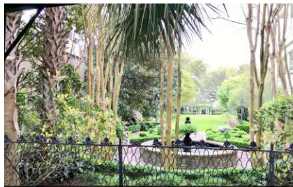
TOUR THE HISTORIC PLANTATION HOMES

5 Charleston's foodie scene is one of the most underrated in the United States, but not for much longer. Biscuits, shrimp and grits, cobbler—if it's real Southern food, you can find it here. Bring on the cheese, cream and butter. Many restaurants use produce and meats from local farms and even more require reservations well in advance. You might come hungry, but you won't leave that way.