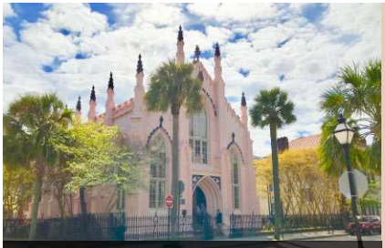
VISIT ALL THE CHURCHES