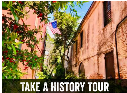
TAKE A HISTORY TOUR