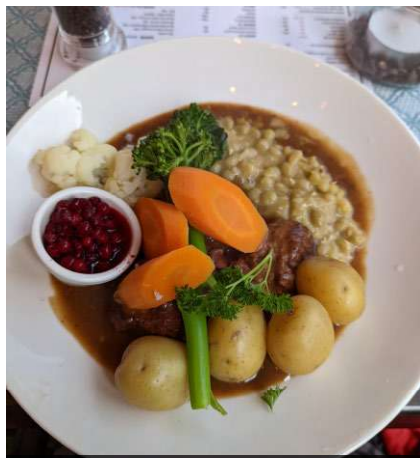
DINE WELL ON TRUE SOUTHERN FARE