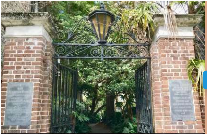
TAKE THE CHARLESTON GATEWAY WALK