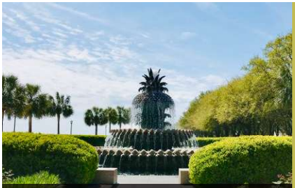
DIP YOUR FEET IN THE PINEAPPLE FOUNTAIN