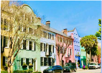
WANDER ONTO RAINBOW ROW