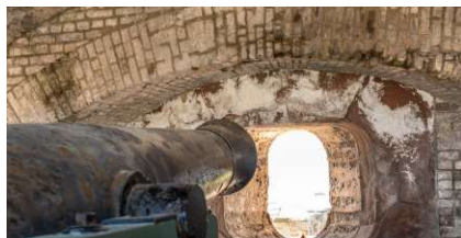
VISIT FORT SUMTER AND FORT MOULTRIE NATIONAL HISTORICAL PARK