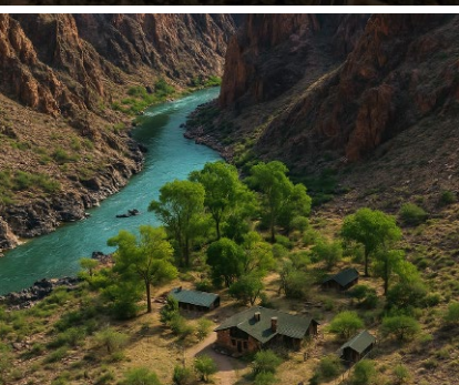
STAY AT PHANTOM RANCH

For quicker bites, Maswik Food Court is perfect for grab-and-go meals. Whether you're fine dining or picnicking at Mather Point, there are plenty of ways to dine with a view.