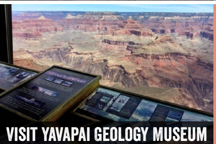
VISIT YAVAPAI GEOLOGY MUSEUM