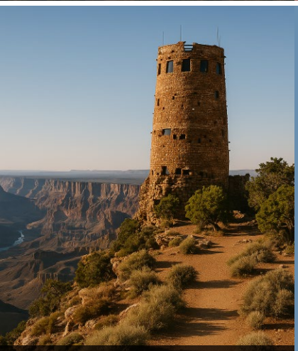
DESERT VIEW DRIVE & WATCH TOWER