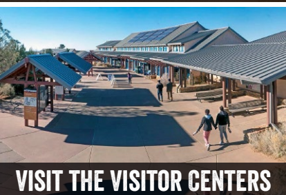
VISIT THE VISITOR CENTERS