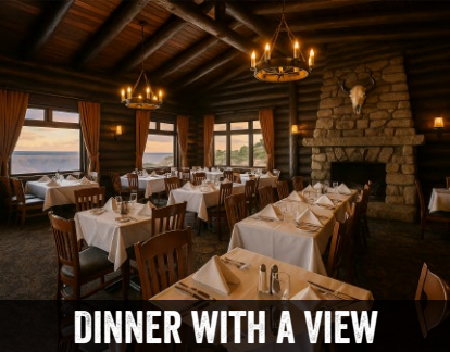
DINNER WITH A VIEW