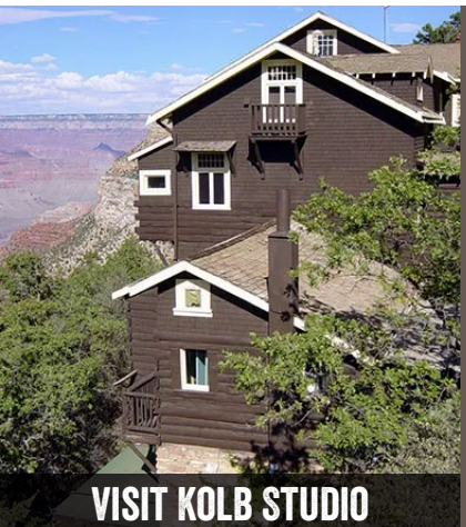
VISIT KOLB STUDIO