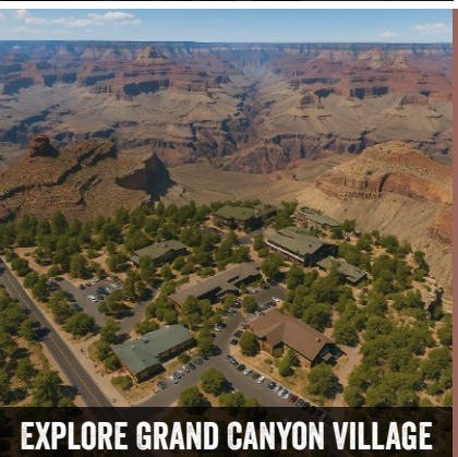
EXPLORE GRAND CANYON VILLAGE