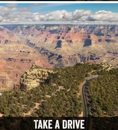
TAKE A DRIVE