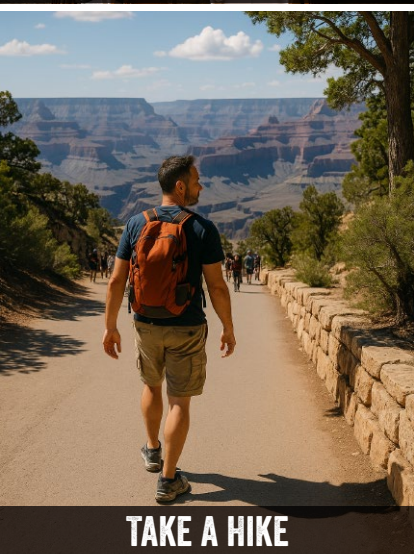
TAKE A HIKE