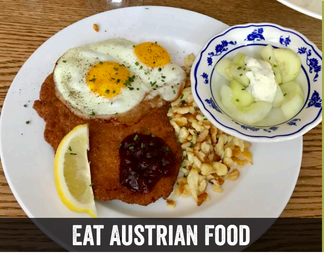
EAT AUSTRIAN FOOD