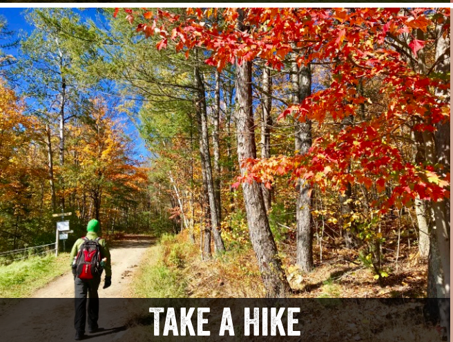
TAKE A HIKE