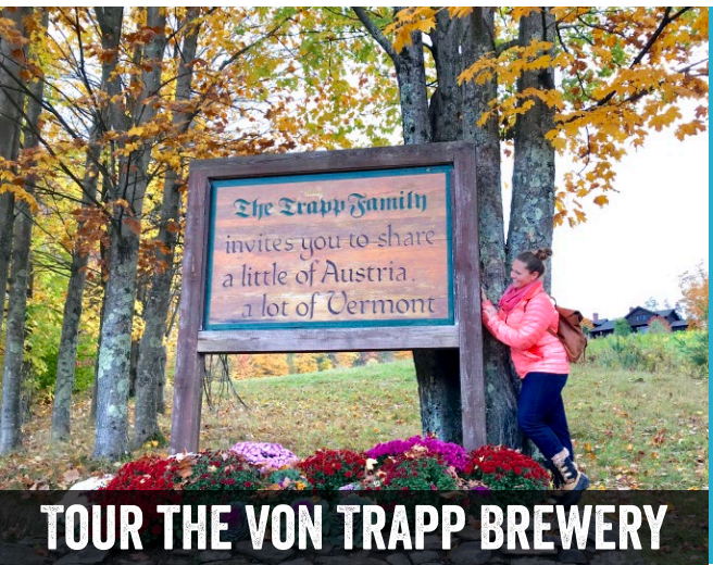
TOUR THE VON TRAPP BREWERY