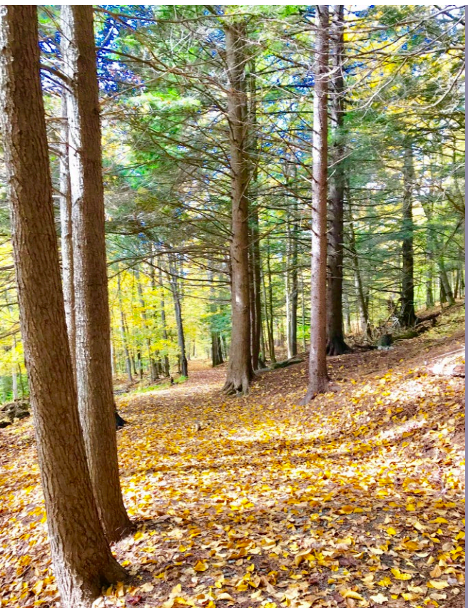
TRY MOUNTAIN BIKING