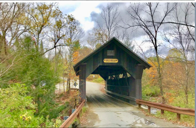
FIND THE COVERED BRIDGES