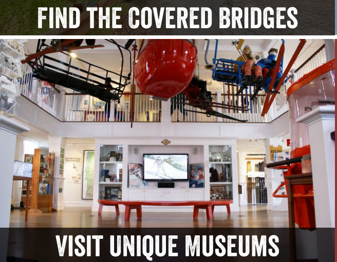
VISIT UNIQUE MUSEUMS