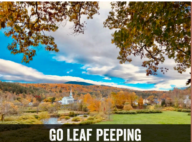
GO LEAF PEEPING