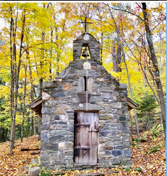
TAKE A SOUND OF MUSIC TOUR