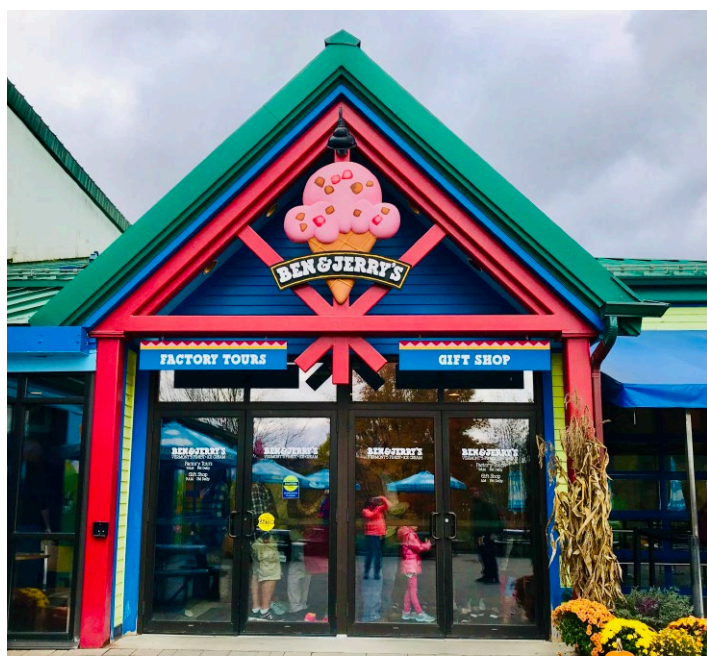
TAKE THE BEN & JERRY'S FACTORY TOUR

cocoa (with extra marshmallows) or après-ski during your trip. Just take some lessons if you're not already an experienced skier.