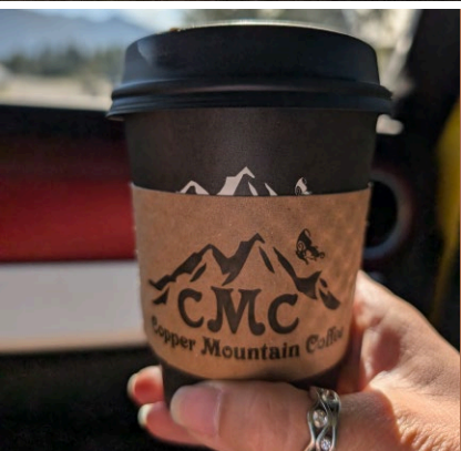
COFFEE, GLORIOUS COFFEE