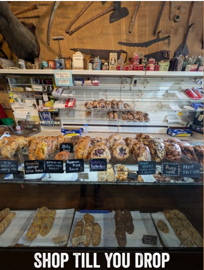
SHOP TILL YOU DROP