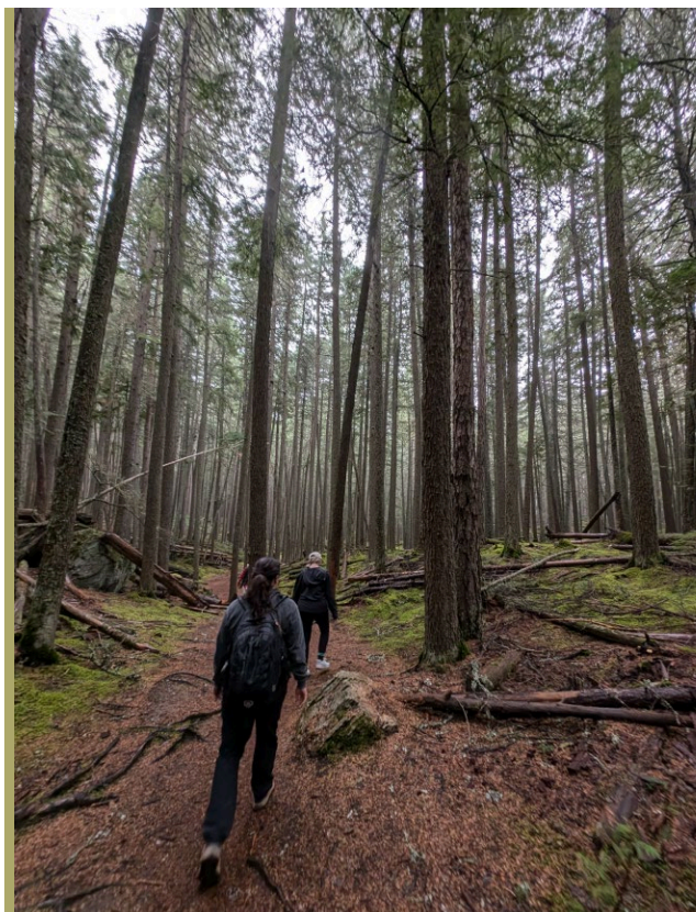
HIKING AND BIKING GALORE!

It seems to be a given that when in the Flathead Valley, you need to visit Glacier National Park. This park is stunning with hikes of all experience levels, waterfalls, rivers, glacial lakes and of course, glaciers. Drive the Going to the Sun Road for epic views and venture to the Pole Bridge entrance at the north of the park. Be sure to stop at the general store for some freshly baked, colossal huckleberry bear claws or a fresh cinnamon roll.