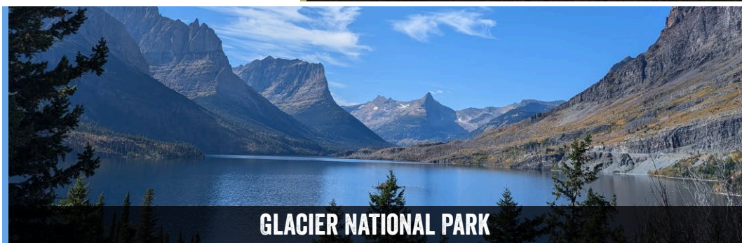
GLACIER NATIONAL PARK