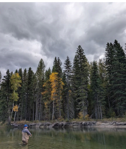
HIT THE WATER