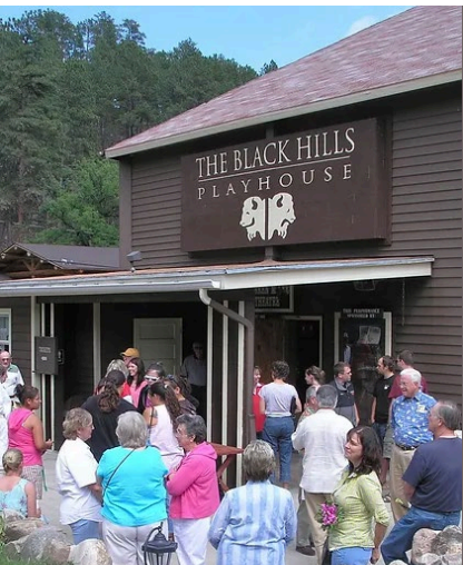
CATCH A PLAY