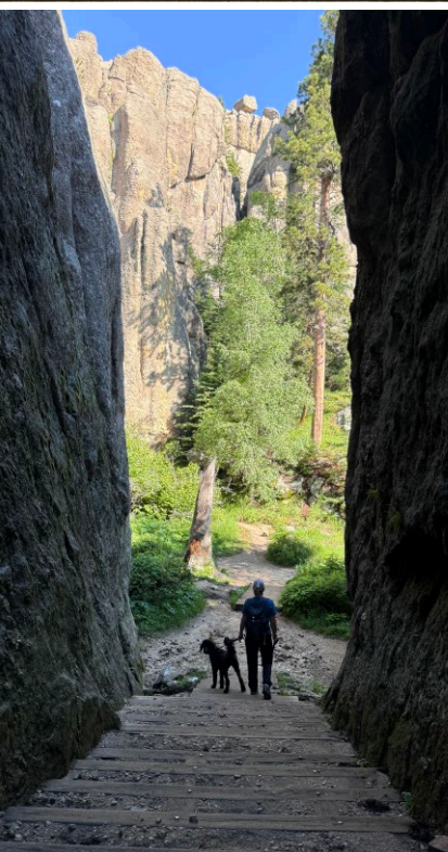
TAKE A HIKE