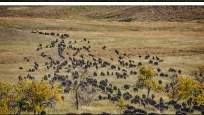
CATCH THE BISON ROUNDUP