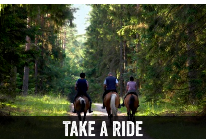
TAKE A RIDE