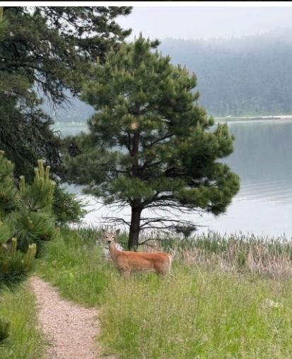
SEE THE WILDLIFE