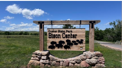
VISIT THE MUSEUM AND VISITOR CENTER