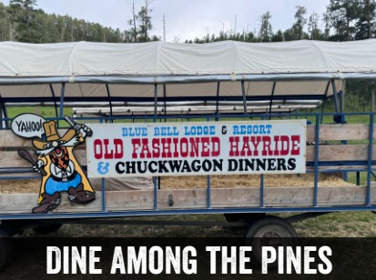
DINE AMONG THE PINES