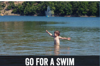
GO FOR A SWIM