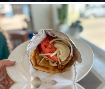
EAT THE LOCAL CUISINE

You don't want to miss the mouthwatering foods offered on these blocks. Greek food is the number one recommendation, although seafood has become increasingly popular. Still, this area is known for its Greek food, so it's highly recommended that you eat at a small mom-and-pop location. A local favorite is Mykonos, with its gyros that will make your mouth water; every detail is homemade and made with love.