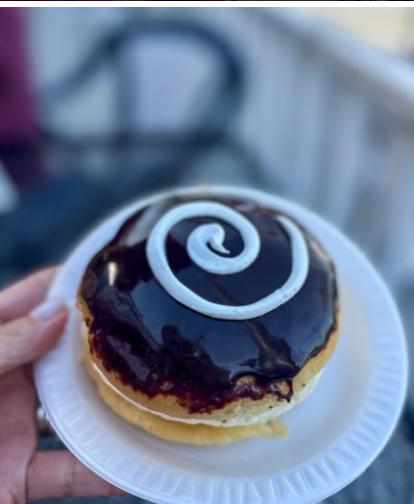
ENJOY A LOCAL BAKERY

This is one of the most amazing things to do while in the area, with various options for different times of day and the type of wildlife you may want to see. This Guided Eco Tour is just a few minutes from the Sponge Docks. You'll wind through the mangroves, with water only a few feet deep most of the time. During the winter months, they feature a manatee tour, which is an absolute must-see. Some wildlife you may see includes dolphins, manatees, otters, bald eagles and various other birds.