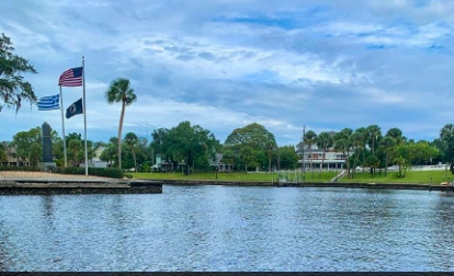
VISIT THE BAYOU