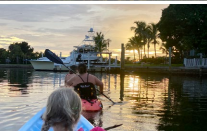
KAYAK THE ANCLOTE RIVER

Less than a mile from the Sponge Docks is Saint Nicholas Greek Orthodox Cathedral. The original frame for this cathedral was erected in 1907; over the years, it has become one of Tarpon Springs's most iconic buildings. The marble in this structure was a gift from the Greek government and was sourced from Mount Pentelicus near Athens, Greece. Locally, it's known for the Epiphany celebration. Every year on January 6th, 16- to 18-year-old young men of the church dive for the symbolic cross tossed into the Tarpon Springs Bayou, with the victor receiving the blessings and grace for the year.