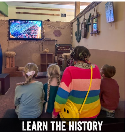
LEARN THE HISTORY