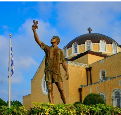
VISIT THE GREEK ORTHODOX CHURCH

It's hard to believe how much history lives in this little area. Ideally situated amongst stunning homes and surrounded by grass lawns, this is the perfect place for a picnic with some of those bakery items available at the Sponge Docks. This area is so famous for one reason alone: the vast ecosystem of marine life. From Florida alligators to the plethora of sponges, Tarpon Springs has much wildlife to enjoy, from the bayou to the shining sea.