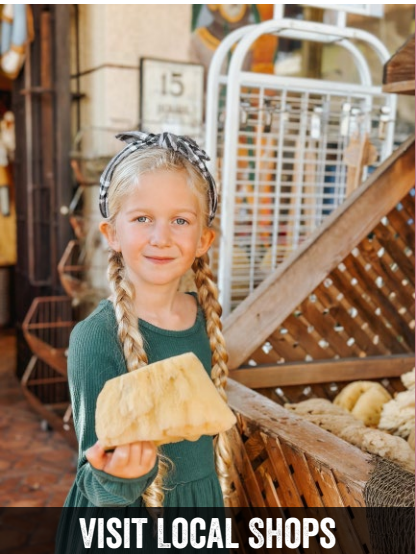
VISIT LOCAL SHOPS