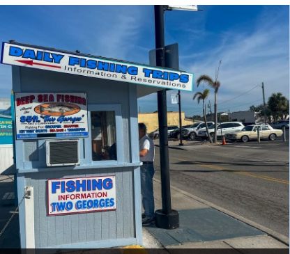
DEEP SEA FISHING