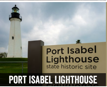
Port Isabel Lighthouse state historic site

If everything is bigger in Texas, South Padre Island, at the southern tip of the state, is a shining example of how to do everything big. From retirees to spring breakers, this 34-mile-long island of beautiful white sand and stunning emerald water has something for everyone. There's no shortage of places to stay, with an RV park directly on the Atlantic Ocean and a fantastic array of rentals. Are you more laid back, or do you like lots of action? You can enjoy anything from a walk on the beach to a dolphin ride or a party atmosphere at a beachfront bar, followed by a horseback ride in the surf. South Padre Island is the perfect island getaway.