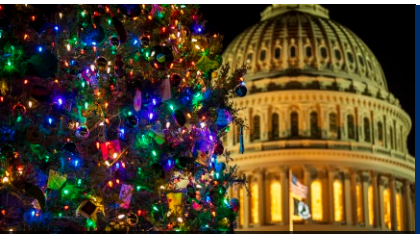
DOWNTOWN HOLIDAY MARKET, WASHINGTON, D.C.

T he Christmas season is synonymous with gifts, warm beverages and singing carols. In recent years, however, a previously European tradition has made its way over to the United States: Christmas markets. Here are the top 10 destinations for European-style Christmas markets in the USA—no passport needed.