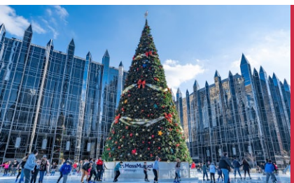
PEOPLES GAS HOLIDAY MARKET, PITTSBURGH, PENNSYLVANIA

7 Dubbed the "Christmas Capital of Texas," you'll find some Christmas spirit for everyone in your RV. Starting November 20 and running through December 30, 2023, their website lists 69 events. The Palace Theatre will play classic movies like Home Alone and The Bishop's Wife. Santa is available for photo-ops daily, and local live entertainment will bring the Christmas cheer. Check their calendar to find out when their parades are happening, take the kids to Story Time with Santa and shop local for all your Christmas gifting needs.