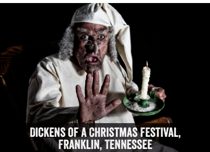
DICKENS OF A CHRISTMAS FESTIVAL, FRANKLIN, TENNESSEE