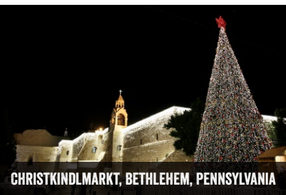
CHRISTKINDLMARKT, BETHLEHEM, PENNSYLVANIA

5 Solvang is a Danish town, through and through. It's a charmer all year round, but it comes alive at Christmastime. It's been dubbed one of the "Most Magical Christmas Towns and Villages Around the World," and its seasonal festivities run from the day after Thanksgiving through January 6. Their European-style, open-air Christmas market is known for its unique gifts and seasonal Danish eats. Visitors can also take a guided candlelight tour led by a costumed guide who will tell of Danish traditions and Solvang's history. You'll feel as if you've been transported to Denmark.