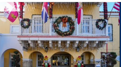
HOLIDAY MARKET, ST. AUGUSTINE BEACH, FLORIDA

10 The nation's capital city has a lot of Christmas going for it: Christmas trees galore, The Nutcracker (played by George Washington himself) and its very own Christmas market. Officially called the Downtown Holiday Market, this annual event runs from mid-November to Christmas Eve Eve (December 23). You'll find everything, including first-edition books, original art, handmade jewelry, hats and sweets, savory items and live entertainment.