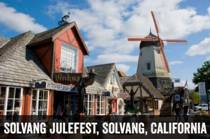
SOLVANG JULEFEST, SOLVANG, CALIFORNIA