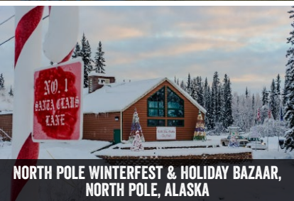
NORTH POLE WINTERFEST & HOLIDAY BAZAAR, NORTH POLE, ALASKA