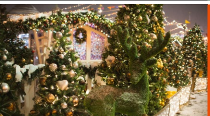
GRAPEVINE CHRISTMAS MARKET, GRAPEVINE, TEXAS

8 If you prefer a more classic Christmas, the weekend-long Christkindlemarkt in Salt Lake City is your answer. It takes place November 29 through December 2, 2023, at This is the Place Heritage Park. Visitors can shop for Christmas gifts, find decorations for their homes, and meet St. Nikolaus. And to put it over the top, there's a variety of live entertainment all weekend long. Because this is a classic, German-themed Christmas market, you'll want to come hungry to sample all the authentic German food and Glühwein.