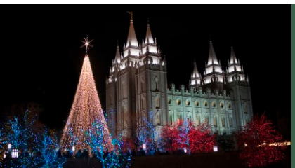
CHRISTKINDLMARKT, SALT LAKE CITY, UTAH

9 Looking for Christmas without the white stuff? You'll find it in Florida. This particular market is one day only (December 9, 2023), but it will undoubtedly get you in the Christmas mood. Shoppers can pick up locally made gifts, foodies can sample holiday fare from various food trucks, and everyone can have fun with their Grinch-themed photo booth. If you want to experience the best of Christmas by the seaside, head to St. Augustine Beach.