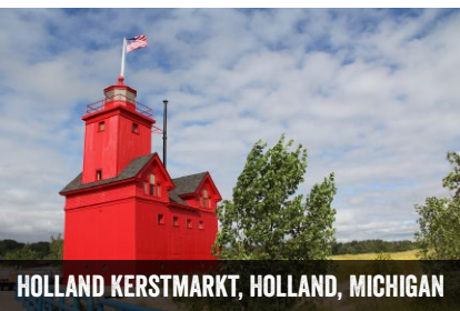
HOLLAND KERSTMARKT, HOLLAND, MICHIGAN