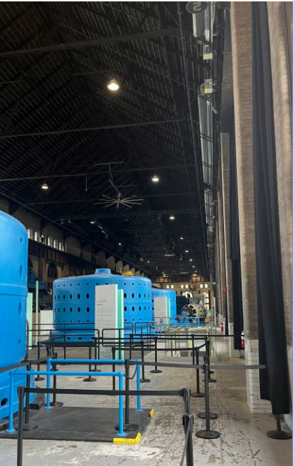
THE TUNNEL AT THE NIAGARA PARKS POWER STATION