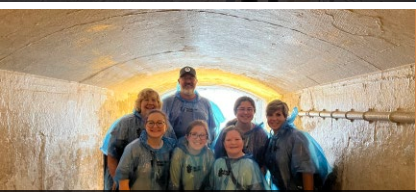
JOURNEY BEHIND THE FALLS