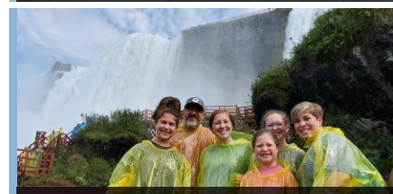
CAVE OF THE WINDS

GET UP CLOSE AND PERSONAL WITH THE FALLS. THESE BOAT CRUISES PROVIDE A UNIQUE PERSPECTIVE FOR VIEWING THE POWER OF THE WATER. IT'S UNLIKE ANY OTHER ATTRACTION.