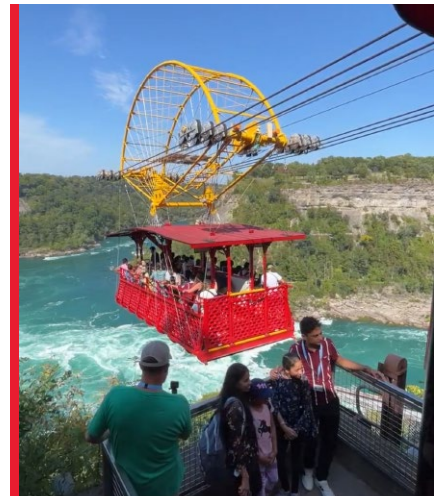
WHIRLPOOL AERO CAR

1 An attraction unique to the American side of the falls, the self-guided Cave of the Winds tour, is unique with each season of the year. After descending in an elevator and suiting up in the standard blue pancho, guests are pointed in the direction of a boardwalk and staircase structure that allows them to adventure as far "into" the falls as they'd like. Waterproof footwear is a necessity for this attraction.