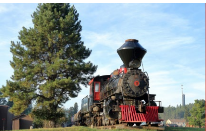
VISIT HISTORIC KEYSTONE

The small town of Keystone is just like you might imagine an 1880s Western town to be. There's the 1880 Train that will take you on a 20-mile journey between Keystone and Hill City, a place to pan for gold, and your pick of restaurants for any meal of the day. And, of course, Mount Rushmore is just around the corner.