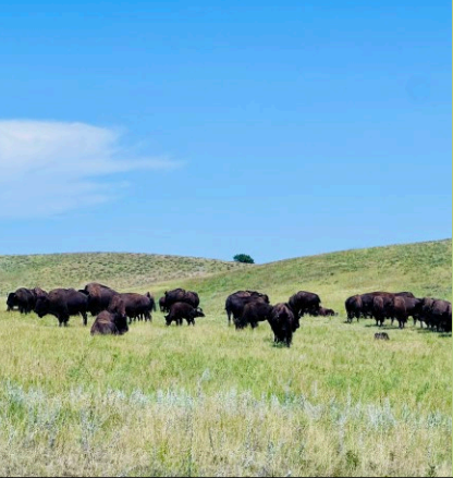
SEE THE BISON