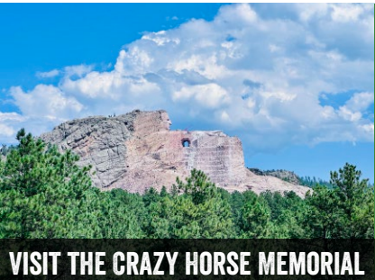
VISIT THE CRAZY HORSE MEMORIAL

Searching for an epic experience? The bison here are giant, even in summer when they're not at their fluffiest. You can see herds of them inside Custer State Park and at the Buffalo Gap National Grassland. Keep your distance, and do not approach them, but bring a camera or phone with a good zoom to capture the moment. Also, stop by the Custer State Park Bison Center for more information and pick up some bison jerky from the state park processing plant.