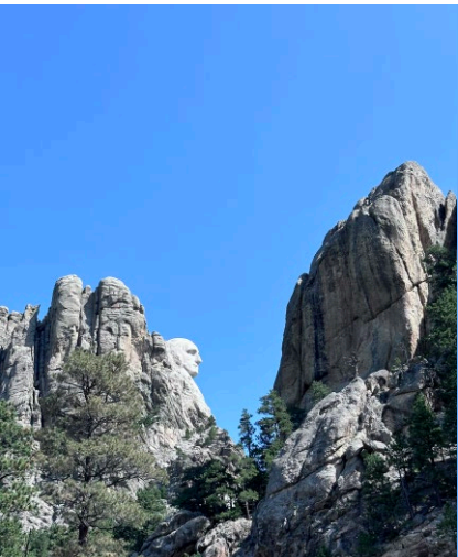
TAKE THE SCENIC ROUTE

You can see it from the road, but it's well worth visiting the visitor center and museum at the Crazy Horse Memorial. It's still a work in progress and will continue to be, but visitors can see him taking shape in the meantime. Don't miss the video at the visitor center that explains the story of Crazy Horse, the sculptor commissioned to carve the mountain, and the ongoing, self-funded project. You can also find the Indian Museum of North America and a restaurant serving authentic local, tribal fare.